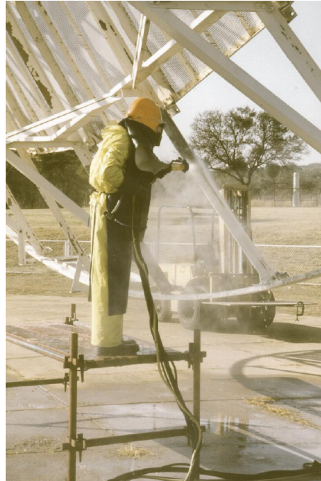
Figure 2. All upgrade work to the telescope surface is done on site by our own staff. Here Amos Kekae is soda-brasting the structure to clean off any old paint.