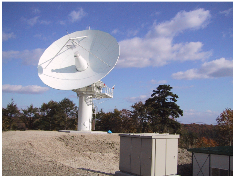
Figure 2. 11-m VLBI antenna at Tomakomai Experimental Forest of the Hokkaido University. The antenna and the VLBI observation facilities were transported from Miura KSP VLBI station in early 2001.

The last VLBI session with the Miura station was carried out on January 4, 2001. The 11-m antenna and the observation facilities of the Miura station were transported to the Tomakomai Experimental Forest of the Hokkaido University after that. The antenna was reconstructed at the new site (Figure 2) and the first successful VLBI observations were performed in November 2001. The 11-m antenna and the observation facilities of the Tateyama station were transported to the campus of Gifu University after the final regular KSP VLBI session on November 30, 2001. The antenna components are now waiting to be reconstructed and the new station is expected to become operational by April 2002.