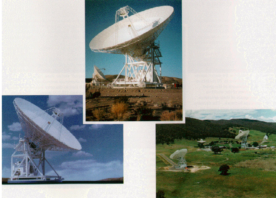
Figure 1. This figure shows the three high-efficiency antennas in the subnet: Goldstone is in the center; Robledo, Spain is in the lower left; and Tidbinbilla, Australia is in the lower right. These antennas were designed to have an optimum efficiency at X-band (8.4 GHz), which was to become the standard downlink frequency for solar-system exploration. An important secondary objective was to have a reasonable efficiency at Ka-band (32 GHz) thereby allowing for possible future use at the next highest band allocated for deep space communications. The subnet was completed in 1986 in time for the Voyager encounter with Uranus.