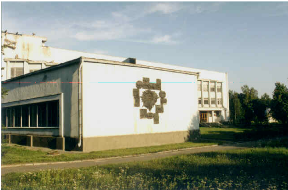
Central building of Main Astronomical Observatory at Golosiiv Wood (southern part of City of Kiev).

The VLBI Analysis Center was established in 1994 by Main Astronomical Observatory (MAO) of the National Academy of Sciences of Ukraine as a working group of the Department of Space Geodynamics of MAO. In 1998 it started its IVS membership as an IVS Analysis Center. The AC MAO is located in Central building of the observatory (shown on the left photo on the figure 1) at Golosiiv Wood in Kiev.