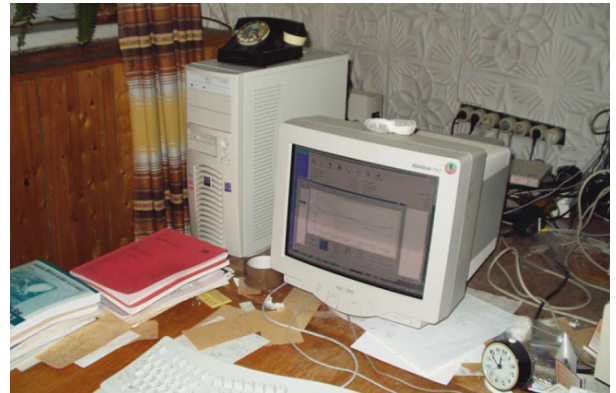
New computer of the MAO Analysis Center running the software SteelBreeze version 2.