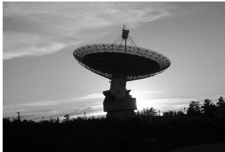
Figure 1. Algonquin Radio Observatory 46m Antenna

This report summarizes recent activities at the Algonquin Radio Observatory.