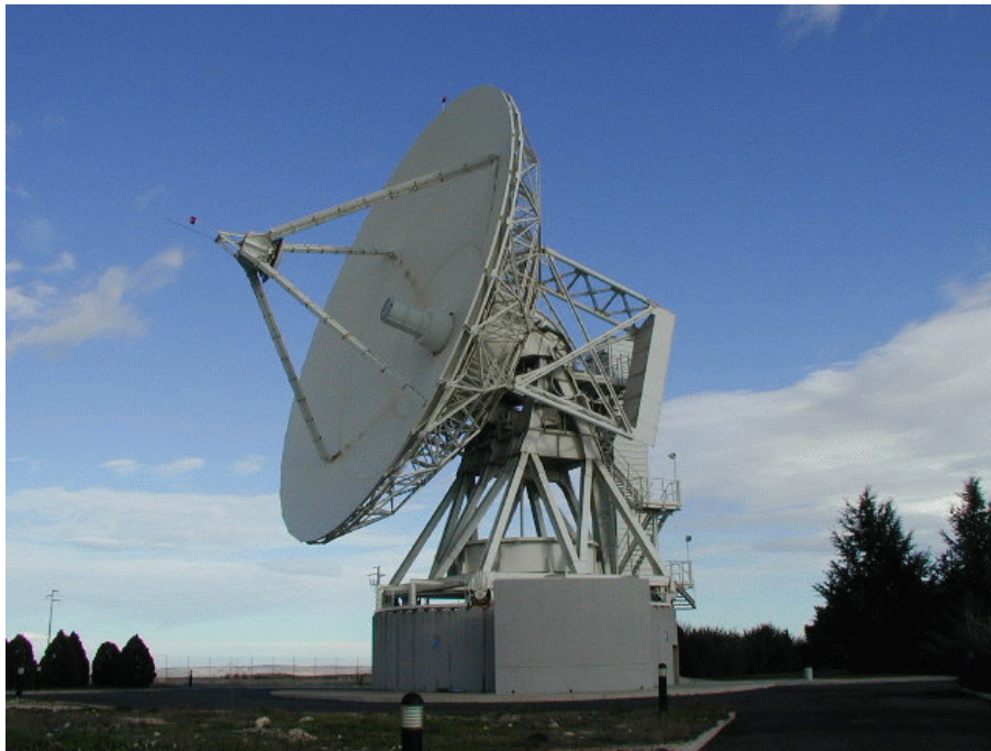
Figure 1. The Matera “Centro di Geodesia Spaziale” (CGS)

The Matera VLBI station is located at the Italian Space Agency “Centro di Geodesia Spaziale” (CGS) near Matera, a small town in the South of Italy. The CGS came into operation in 1983 when