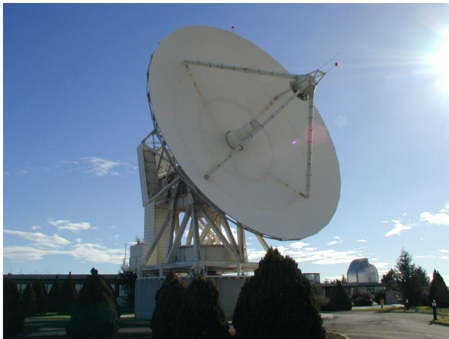
Figure 1. The Matera “Centro di Geodesia Spaziale” (CGS)

The Matera VLBI station is located at the Italian Space Agency “Centro di Geodesia Spaziale” (CGS) near Matera, a small town in the South of Italy. The CGS came into operation in 1983 when