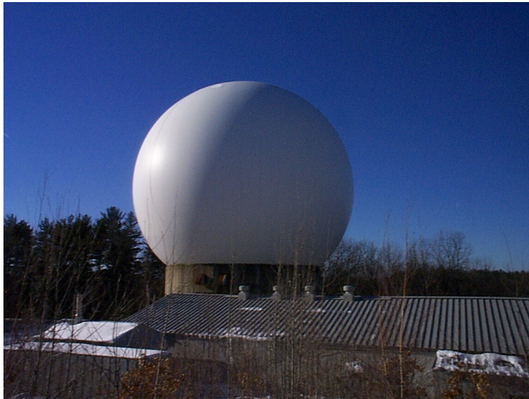
Figure 1. The radome of the Westford antenna.

Since 1981 the Westford antenna has been one of the primary geodetic VLBI sites in the world. Located ~70 km northwest of Boston, Massachusetts, the antenna is part of the MIT Haystack Observatory complex.