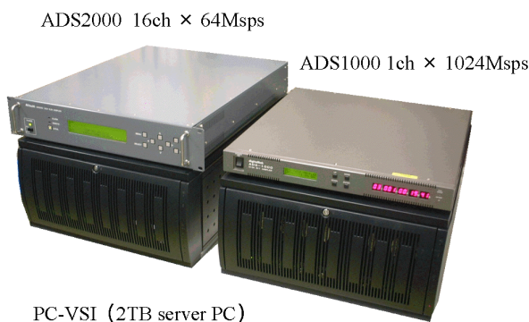
Figure 3. K5/PC-VLBI system: PCs with PC-VSI board (2TB server), a giga-bit A/D sampler (ADS1000), and a 16ch \times 64Msps sampler (ADS2000).