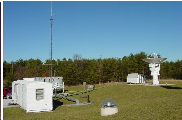
Figure 2. New permanent MV-3 antenna.

GGAO is located on the east coast of the United States in Maryland. It is about 15 miles NNE of Washington D.C. in Greenbelt, Maryland (Table 1).