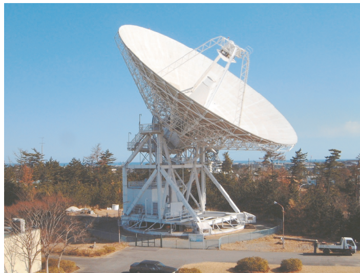
Figure 1. The Kashima 34-m radio telescope.

The Kashima 34-m telescope (Figure 1) was constructed by National Institute of Information and Communications Technology (NICT), formerly Communications Research Laboratory (CRL), in 1988. The telescope is located about 100 km east of Tokyo, Japan. During 17 years of operation, the telescope has been kept in a fairly good condition and the antenna has participated in various VLBI and single-dish observations. The 34-m telescope is operated by the Radio Astronomy Applications Group of Kashima Space Research Center (KSRC), NICT.