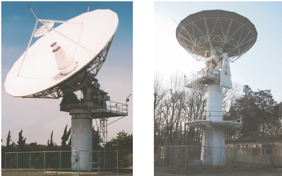
Figure 2. 11-m VLBI antennas at Kashima (left) and Koganei (right).

11-m antenna and other VLBI facilities at Miura and Tateyama stations have been transported to Tomakomai Experimental Forest of the Hokkaido University and to the campus of Gifu University, respectively. As a consequence, two 11-m stations at Kashima and Koganei (Figure 2) are remaining as IVS Network Stations. After the regular VLBI sessions with the Key Stone Project VLBI Network terminated in 2001, 11-m VLBI stations at Kashima and Koganei are mainly used for the purposes of technical developments and miscellaneous observations.