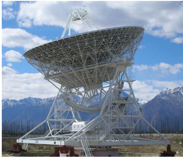
Figure 1. Badary Observatory.

The Badary Radio Astronomical Observatory (BdRAO) was founded by the Institute of Applied Astronomy (IAA) as one of three stations of the Russian VLBI network QUASAR [1]. The sponsoring organization of the project is the Russian Academy of Sciences (RAS). The Badary Radio Astronomical Observatory is situated in the Burytia Republic (East Siberia) about 130 km east of Baikal Lake (see Table 1). The geographic location of the observatory is shown on the IAA RAS [3] Web site. The basic instruments of the observatory are a 32-m radio telescope (see Fig. 1) and technical systems for making VLBI observations.