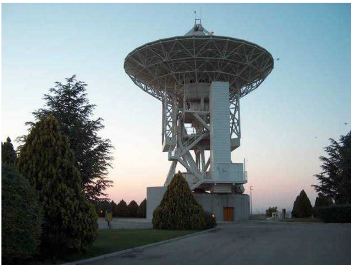
Figure 1. The Matera "Centro di Geodesia Spaziale" (CGS).

The Matera VLBI station is located at the Italian Space Agency's 'Centro di Geodesia Spaziale G. Colombo' (CGS) near Matera, a small town in the south of Italy. The CGS came into operation