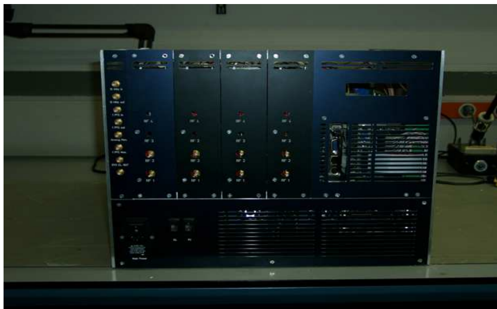
Figure 3. DBBC rear view