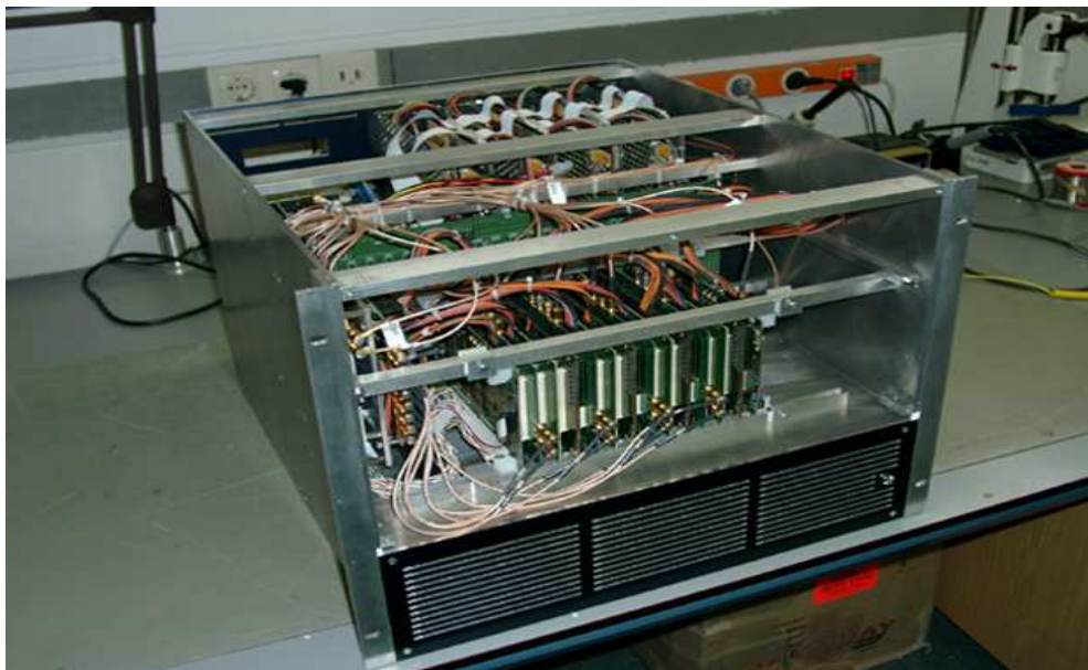
Figure 1. DBBC internal view

The hardware side of FILA10G, the interface between the DBBC (or any VSI device) and 10 G network, has been completed. A team composed of IRA/MPI/SHAO personnel is jointly developing the firmware. The board will be an interface for the Mark 5C or a direct connection to the network at 1-2-4-10-20 Gbps. It can be used as a standalone element between VSI and the network. The VDIF protocol will be adopted as the data format.