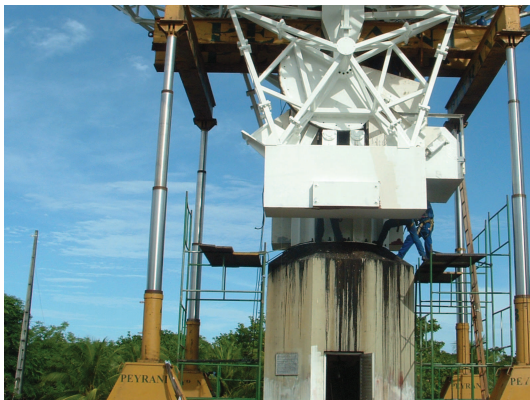
Figure 1. Antenna ready to be lifted up from the azimuth base for bearing replacement.