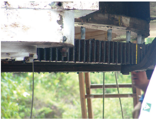
Figure 3. Old bearing being removed.

When searching for companies to provide the repair services, we received proposals from four companies, each offering a different solution. The repair job was awarded to the Brazilian company Robrasa and their installation company partner Peyrani, who had presented the best and most technically consistent bid for the job. Their offer exhibited the best solution in terms of risk, cost, and benefit. The repair consisted of the fabrication of a new bearing, which was performed at the Robrasa factory in Diadema, near São Paulo, and accomplished in six months, and of the new bearing shipment to Eusébio site (the Fortaleza VLBI facility), followed by the replacement. For this, the antenna was lifted up and displaced, the old bearing was removed, the new bearing was put into place, the antenna was relocated, and checks, tests, and azimuth movements were done for final acceptance. The installation was performed over a period of twelve days. All phases were performed successfully and on schedule. A pictorial of the work steps can be found at http://200.129.55.1 . A rather unique methodology was used by Robrasa. The entire antenna structure, without removal of any pieces, was separated from the tower using hydraulic jacks running on rails, leaving the azimuth area free for the work. Figures 1–6 illustrate the procedure.