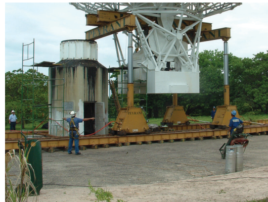
Figure 2. Antenna after being moved to the side of the pedestal.