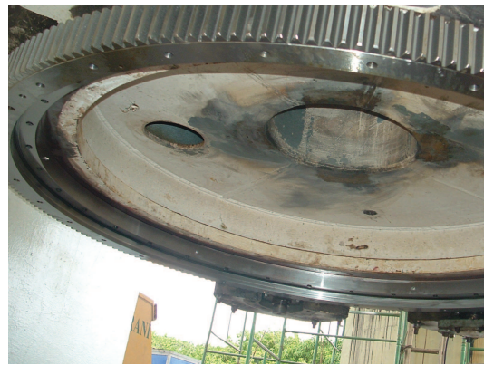
Figure 4. Detail of the new bearing installed.