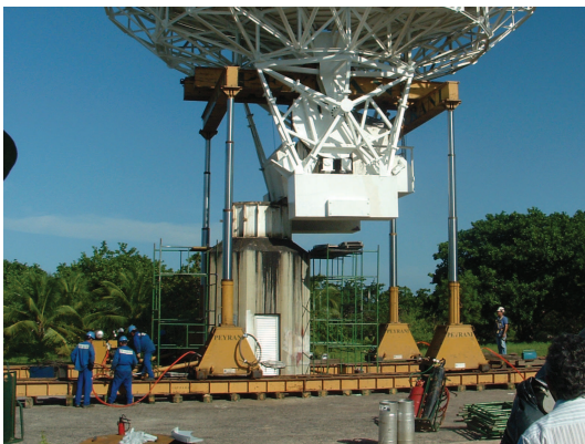
Figure 5. Antenna being moved back.