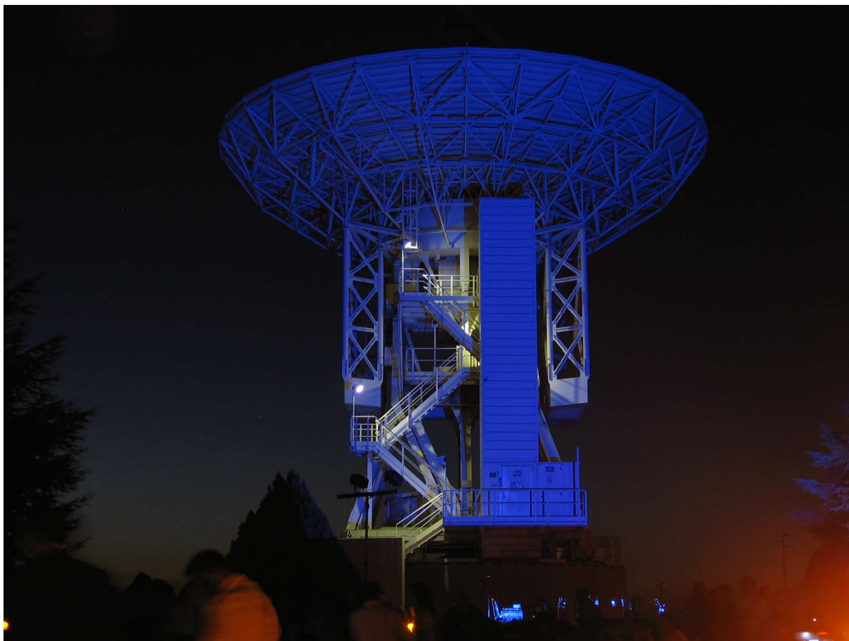
Figure 1. The Matera “Centro di Geodesia Spaziale” (CGS).

The Matera VLBI station is located at the Italian Space Agency’s ‘Centro di Geodesia Spaziale G. Colombo’ (CGS) near Matera, a small town in the south of Italy. The CGS came into operation in 1983 when the Satellite Laser Ranging SAO-1 System was installed at CGS. Fully integrated into the worldwide network, SAO-1 was in continuous operation from 1983 up to 2000, providing high precision ranging observations of several satellites. The new Matera Laser Ranging Observatory (MLRO), one of the most advanced Satellite and Lunar Laser Ranging facilities in the world, was