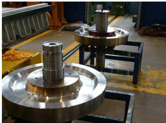
Figure 3. a) New wheels