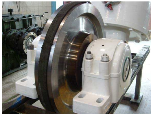
b) Wheel, support and reducer gear coupling