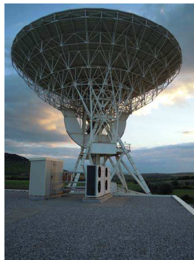
Figure 4. It's the end of the work!!!