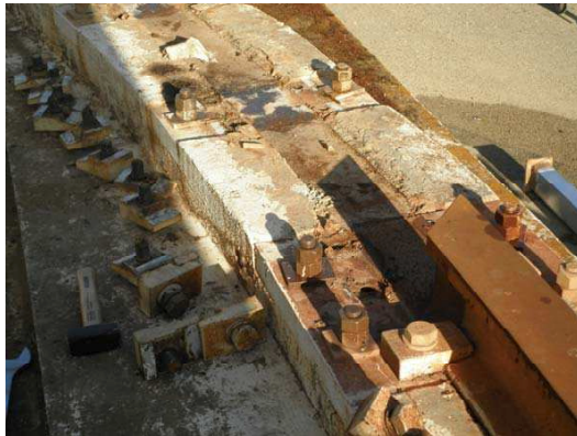
Figure 1. a) Rail track removal