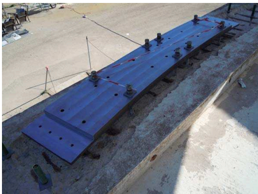
Figure 2. a) Continuous metal plate installation and b) grouting phase