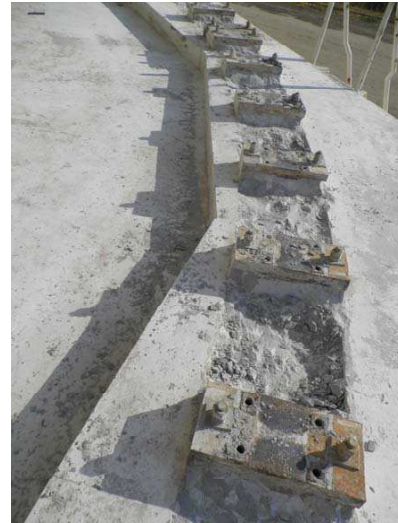
b) Grout removal, metal plates visible