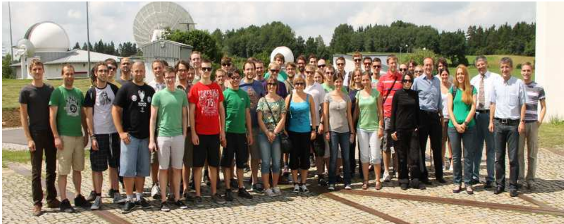
Figure 1. Excursion to Wettzell in June 2012 with staff members and students of the master course.

Since October 2012, we have been part of the Department of Geodesy and Geoinformation (GEO) in the Faculty of Mathematics and Geoinformation of the Vienna University of Technology. GEO is divided into seven research units, one of them focusing on advanced geodesy (mathematical and physical geodesy, space geodesy). Within this research unit, one group (out of three) is dealing with geodetic VLBI.