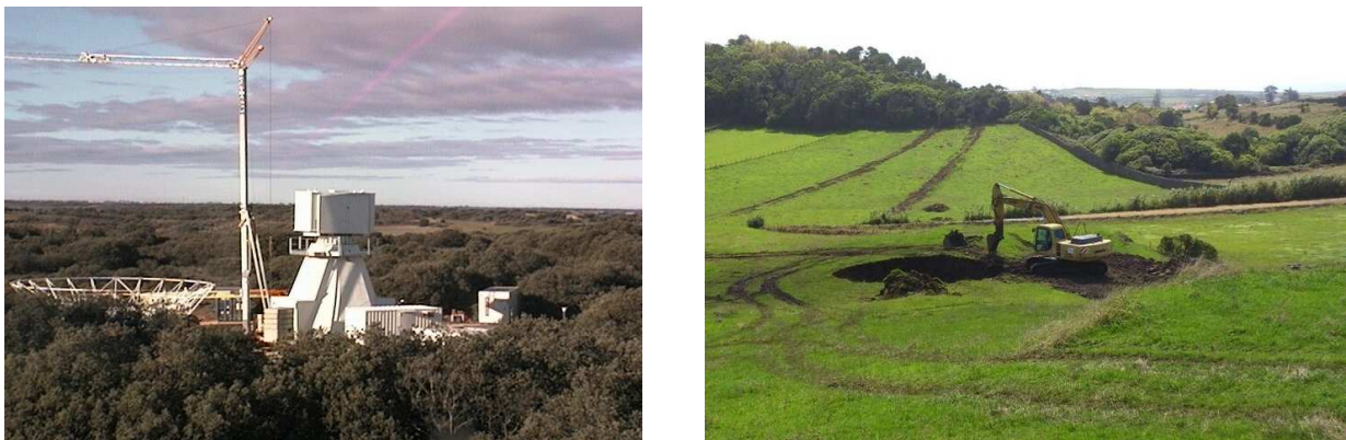
Figure 2. Left: RAEGE telescope under construction at Yebes. Lifting of the azimuth cabin. Right: Work for the RAEGE telescope in Santa María (Azores Islands).

IGN, together with its Portuguese colleagues in DSCIG (Azores Islands), continues the construction of a network of four new Fundamental Geodynamical and Space Stations. The RAEGE project has been described in previous IVS Annual Reports. The first antenna is being erected in Yebes (see Figure 2), and the construction of a tri-band (S/X/Ka) receiver and optics, developed at Yebes Labs, is also progressing. It is expected to be completed and to start operation in 2013. Activities have also started at RAEGE's Santa María site with the construction of the concrete tower and the infrastructure facilities. The assembly of the steel backstructure is anticipated for June 2013. On September 17, 2012, an official inauguration ceremony kicked off the start of construction. The event took place in the presence of local authorities as well as regional government representatives. The infrastructure project includes the construction of the main control building, a building for power distribution, a social facilities building (to be built in a second phase), and access roads. The Santa María site will include a completely isolated gravimetry pavilion, buried in a small hill, on top of which a permanent GNSS station will be installed.