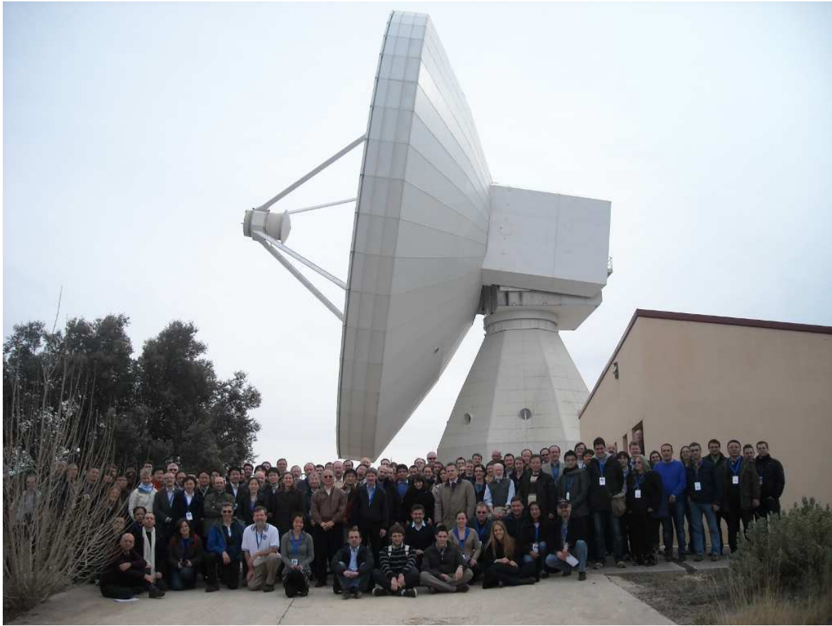
Figure 3. Participants in the 7 th IVS General Meeting are photographed in front of the IGN 40-m radio telescope at Yebes Observatory.