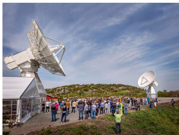
Fig. 1 The inauguration of the Onsala twin telescopes was held on 18 May 2017.

Observatory. At Onsala retired colleagues that participated in the first experiment were invited (see Figure 2). Bert Hansson gave a lecture, describing both the extensive preparations as well as the execution of this first experiment.