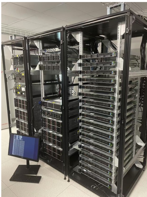
Fig. 1 The hardware platform of the DiFX software correlator.