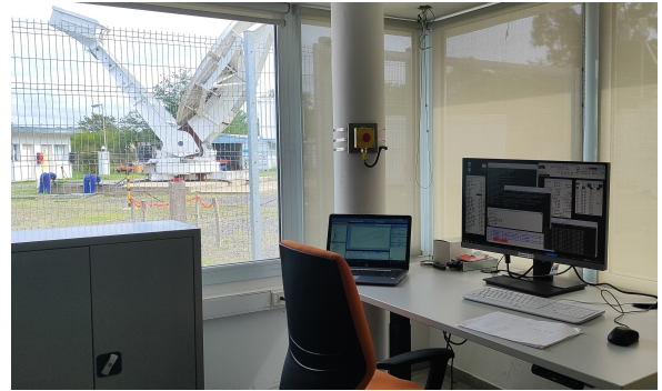
Fig. 1 The new control room at AGGO, giving view to the 6-m primary focus offset radio telescope for VLBI observations.

A planned overhaul action for 2024 was the relocation of the VLBI hardware from the container where it has been since the arrival of the observatory in Argentina to a new control room (see Figure 1) located in the main building of AGGO. For this task the original manufacturer of the antenna was contracted. This measure also included the installation of new cables between the control room and the base of the antenna, as well as the replacement of the hybrid cables which run through the drag chains of the antenna. A new junction box was in-