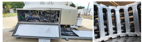
Fig. 2 The new junction box at the base of the antenna (left). The new hybrid cables in the azimuth drag chain (right).

stalled at the base of the antenna for the transition between the hybrid cable and the underground cables (see Figure 2).