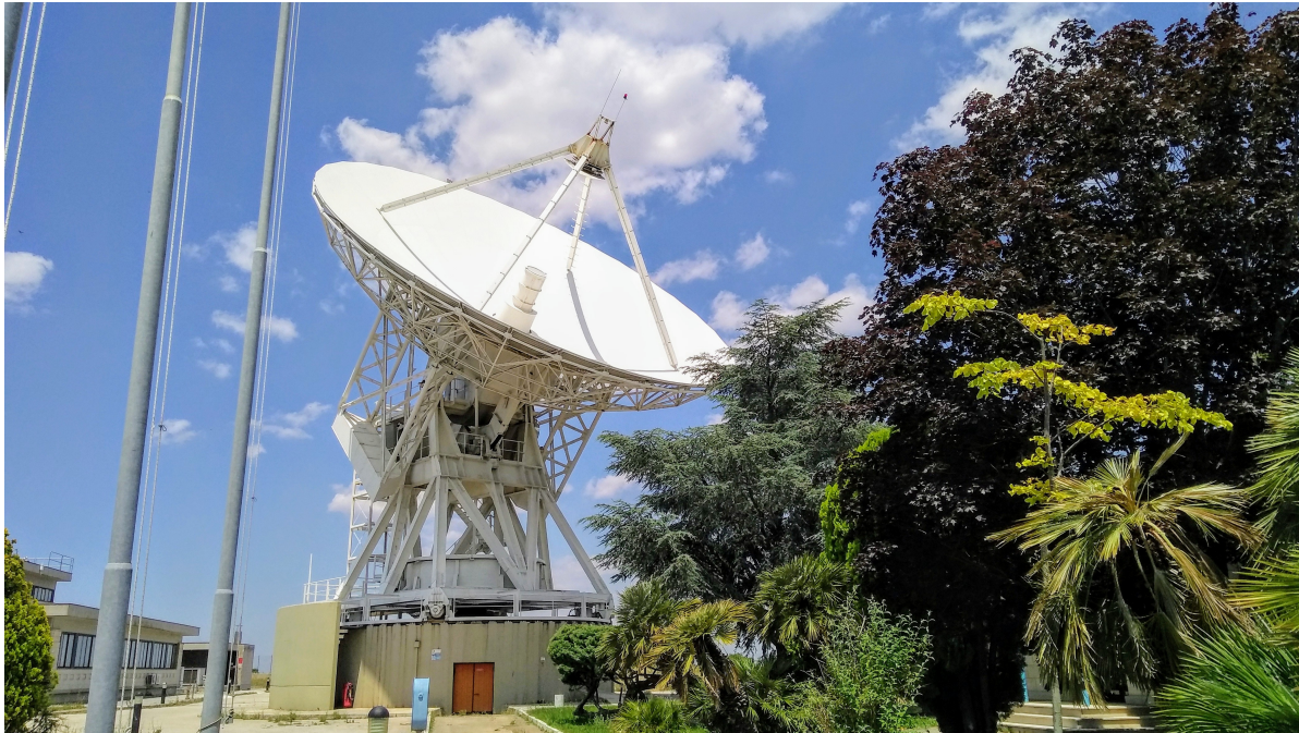
Fig. 1 VLBI antenna.