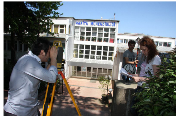
Students performing a local survey at the Department of Geomatics Engineering of KTU.