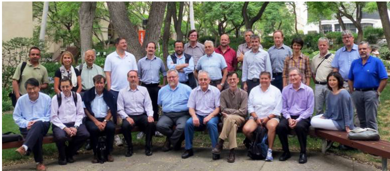
Meeting attendees for the Unified Analysis Workshop.