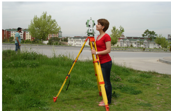
Survey work on the Hacettepe University campus.