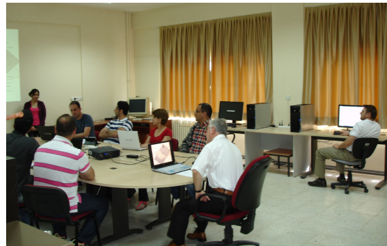
Master class at the Geomatics Engineering Department of the Hacettepe University.