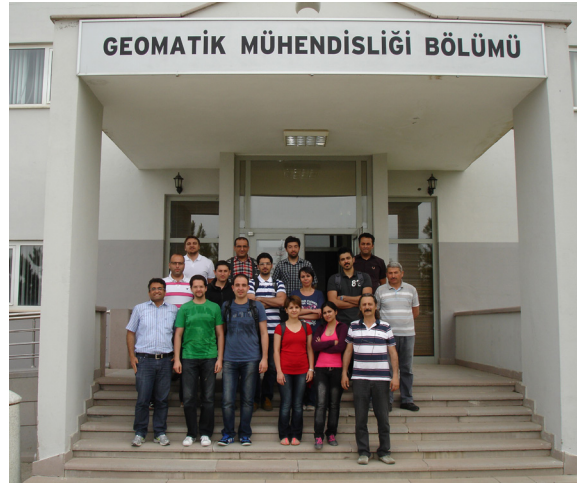
Master students at the entrance of the Geomatics Engineering Department building of the Hacettepe University in Ankara.

Considering the situation of VLBI in Turkey, our dream would be to have radio telescopes observe in IVS sessions, maybe even to track spacecraft, and to have enough technical background and scientific knowledge about space missions and radio astronomy. In order to realize our dream, we need to work hard and get financial support from national scientific funding organizations.