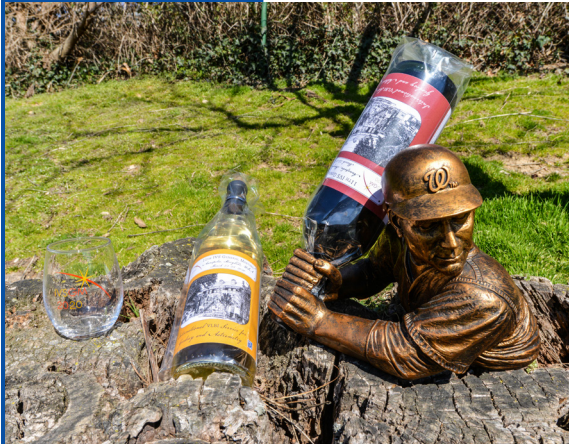
A still-life with the giveaway collection.

The 12th IVS General Meeting will be organized by the Finnish Geospatial Research Institute (FGI, National Land Survey of Finland) and is likely to be held in late March 2022 in the greater Helsinki area. With GM2022 we will also celebrate the completion of the geodetic core station at Metsähovi.