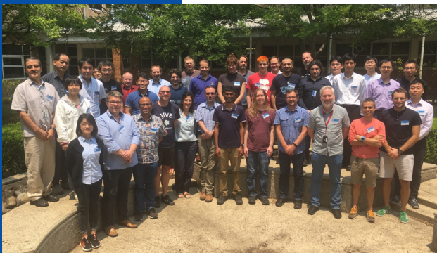
Participants of the 8th International VLBI Technology Workshop in Sydney.

The 8th International VLBI Technology Workshop (IVTW) was held in Sydney at the CSIRO's Marsfield Centre over three days in November. This followed on from the DiFX developer's meeting held in Melbourne the week before.