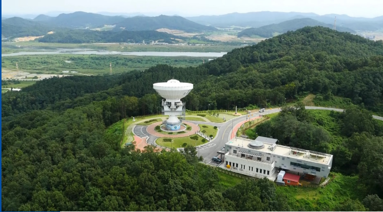
Aerial view of Sejong Station taken using a drone.

Sejong Station is the first geodetic VLBI station in the Republic of Korea, its main purpose being to support geodetic VLBI observations. To this end, the station (known within the IVS by its two-letter code 'Kv') sports a 22-m diameter telescope. The site has been an IVS Network Station since April 2012. Newsletter Editor Hayo Hase checked in with Sang-oh Yi to learn more about the station and its people. The following is what Hayo found out in an e-mail interview.