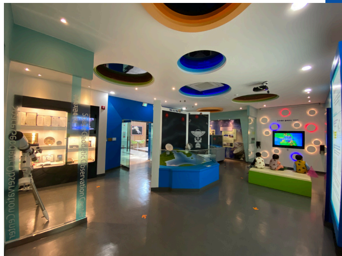
Visitors, young and old, can learn a thing or two in the Sejong Center for Public Relations.