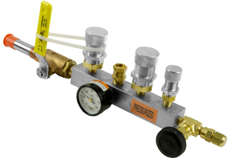
Picture of a helium maintenance manifold. The fill from the helium bottle is on the right, the purge to atmosphere is on the left, and the supply and the return helium lines attach to the two large connectors on the top side.

Spring has not quite sprung in the northeast United States, but already some days have reached 20°C. During this time of the year we always experience some warming in the cryogenic system, as the ambient temperatures and sun loads increase from winter. With the older Model 22 refrigerator, it may be the time to change the cold head. But with the new Model 350, we can see 18, 24, or even a bit more months of use before failure. So, in the springtime we purge contaminants from the system. This involves starting with a cold system, turning off the cryo compressor, and immediately disconnecting the supply and return lines from the back of the compressor. We connect these lines to a helium maintenance manifold, which allows us to fill the cold head from a supply bottle of Ultra High Purity helium, and also allows us to purge to atmosphere. We then warm the system to ambient and flush the cold head by first purging the helium from the supply and return lines and the cold head, filling the manifold, lines, and cold head from the supply bottle, and then operating the cold head at between 195 and 205 PSI for 10–30 seconds. This process is repeated five times in total. The procedure clears the formerly frozen contamination from the cold head, hopefully giving you a worry-free summer of operations!